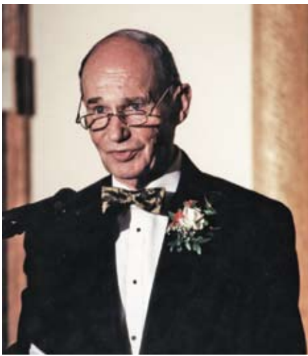
Celebrating our 50th Wedding Anniversary June 16, 2005