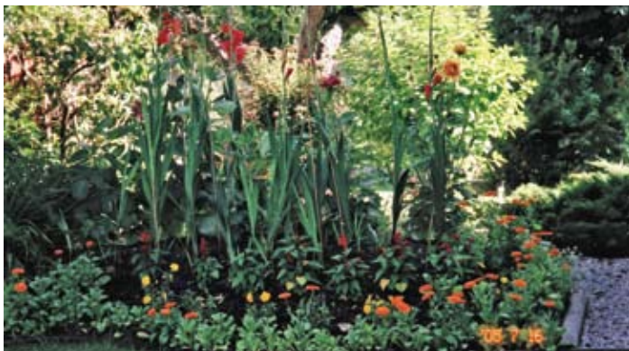
Plots of our prize-winning flowers and borders

I have served as president of the Insurance Brokers of BC, chair of The