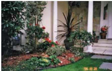
Welcome to our front door.