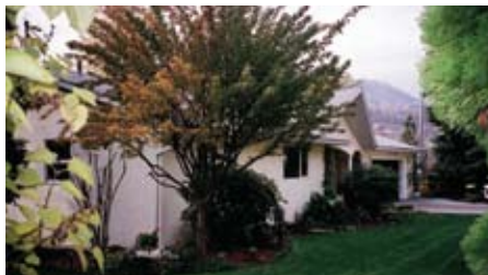
Hawthorne tree in bloom at north-east corner of our home

To me, the most important part of life is being a good husband, father, and grandfather; being respected in the community; and serving others as a practising Christian. We contribute quite substantially to relief organizations and other groups that need assistance.