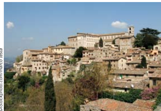
The small Umbrian town of Todi, the birthplace of Jacopo dei Benedetti

We hope to discover some of the other Notaries who worked with this most interesting gentleman. ▲