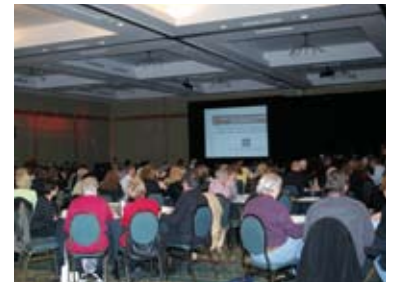
A section of the large classroom

A total of 309 BC Notaries, graduates of the Class of 2008, Notary students, and guests attended the Notaries' Spring Conference 2008 at the Sheraton Wall Centre on April 19 and 20.