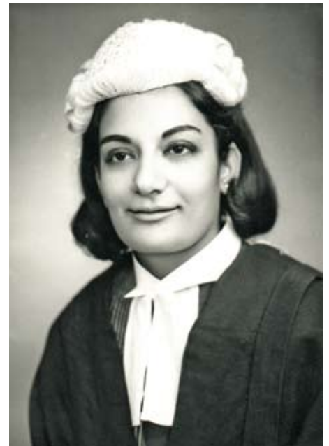
Called to the Bar at Law in 1965 in London, England

She opened her practice in 1977 in North Vancouver, sharing offices