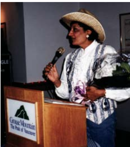
Addressing the North Shore Chamber Mexican night function

In Winter, we ski and play bridge, both socially and at a duplicate bridge club. Our involvement with sports clubs and the Chamber of Commerce