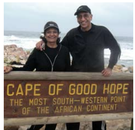
On a recent trip to South Africa

Voice: 604 986-2131 Fax: 604 987-8162 gmitha@look.ca