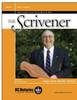
Fall 2004, Volume 13, Number 3