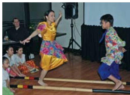
The National Dance: Tinikling