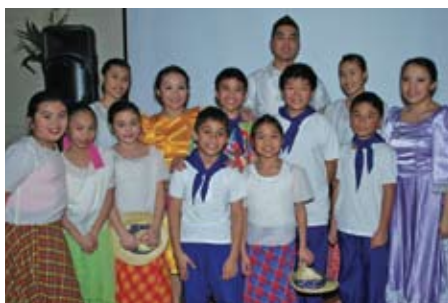
Our colourful entertainers from the Kapamilya Multicultural Society