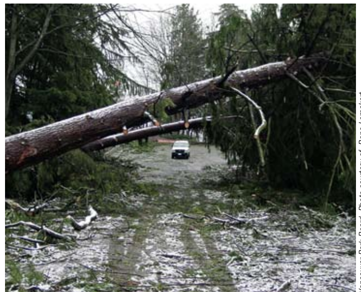
Vancouver Park Board.