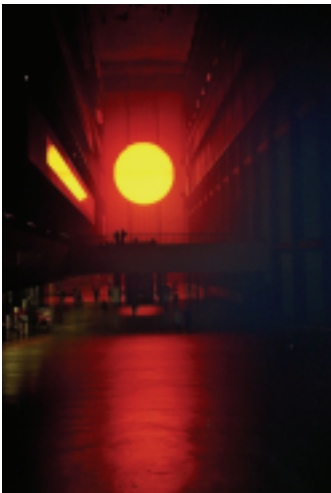
Artist Olafur Eliason's "The Weather Report," at the Entrance to Tate Modern, a former power house on the River Thames