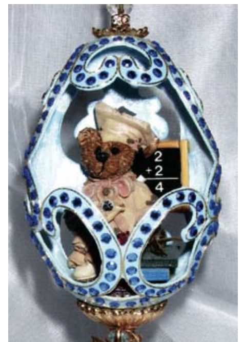
Goose egg made for my daughter's graduation. The name of her school and her grad date are on the sides.