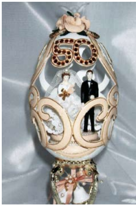
Large goose egg made for my parents' 50th wedding anniversary. The back showcases their names, wedding date, and one of their wedding photos.