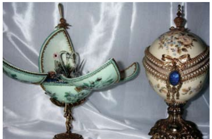
Ostrich eggs. The one on the left has a music box and also lights underglass swans. The one on the right is a jewellery case.