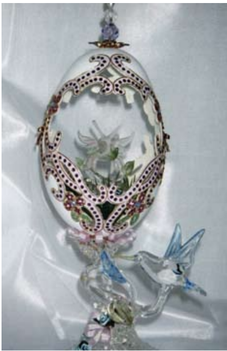
Large goose egg, filigree-cut