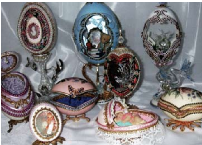
A collection of decorated eggshells: Duck, goose, and emu eggs

Once the eggshell is cut, the inside is reinforced with glue, except