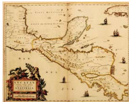
Mesoamerica, with prominent Yucatan

In 1518, Diego Velazquez, the Spanish governor of Cuba, appointed his private secretary Hernan Cortez to explore the unknown lands to the west. In February 1519, Cortez sailed for the Yucatan, landing at Merida on Good Friday. From there, he marched into what is now Mexico.