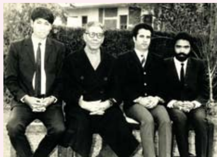
Outstanding students with the Dean of Kurkshetra Law School, 1972