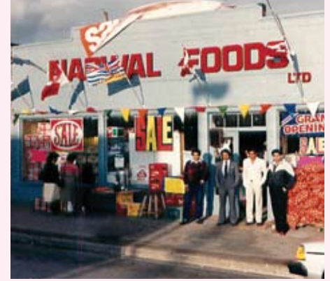
Opening of Narwal Foods, 1986

his practice, his businesses, and his community involvement.