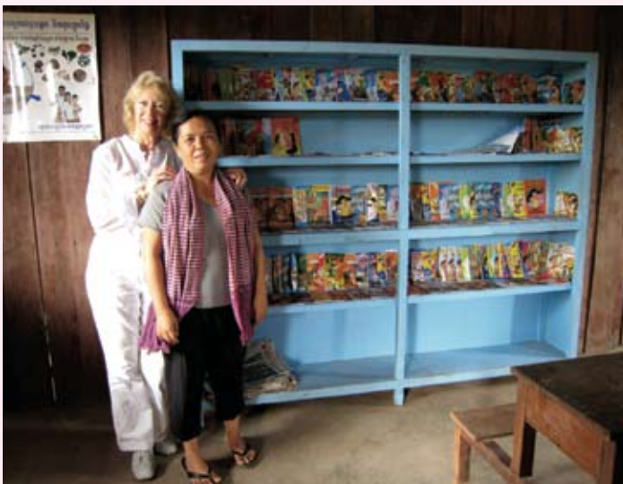
First "Toonie" library, Cambodia