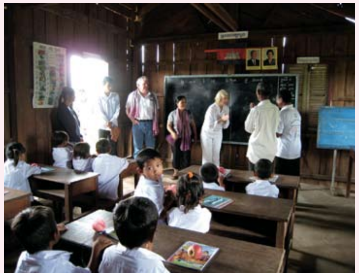
Village Elders asking for a high school in Cambodia