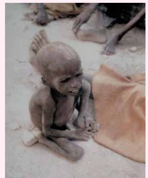
Famine victim, Kenya, East Africa