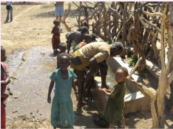
Bath time in the Highlands, Ethiopia, East Africa