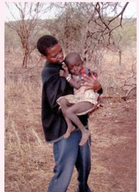
Famine rescue, Kenya, East Africa