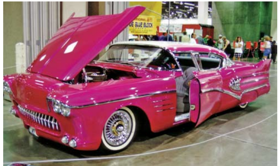
Buelah the Buadillac