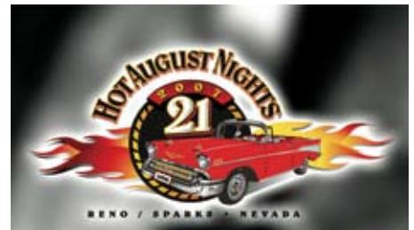
Current HAN Logo