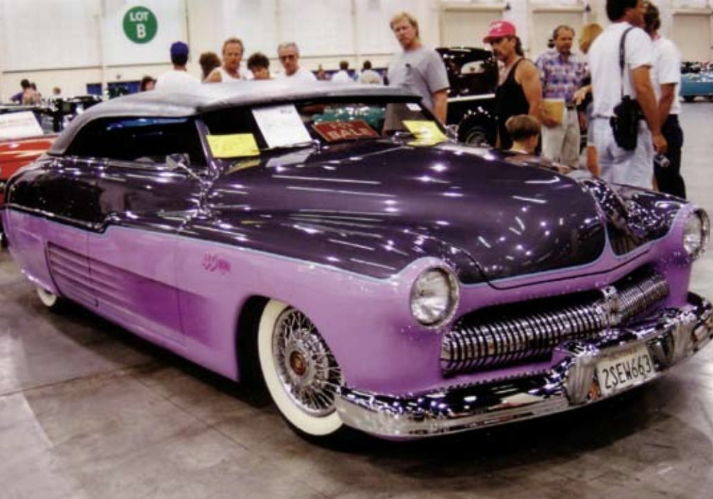
At the auction, Trish tried for a pair!

with most casinos following suit in the '50's theme—from pony tails to poodle skirts.