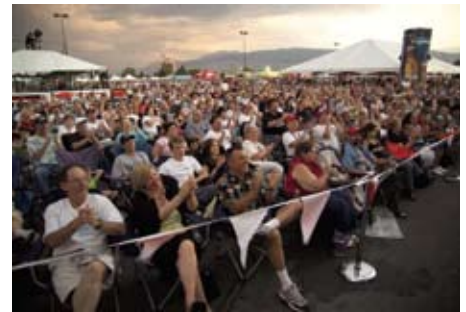
Crowds enjoying an outdoor concert